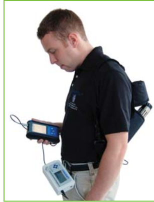
FM-801 (on optional ACC-BELTCL-1 belt clip) shown connected to GrayWolf AdvancedSense™