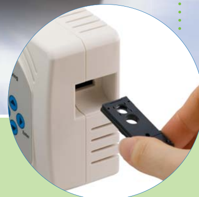
Detachable Sensor Cartridge