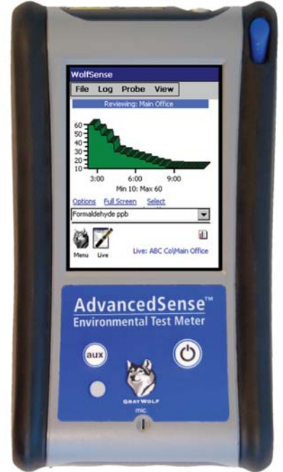
Display real-time HCHO graphs, attach text/audio notes and access many other powerful features when interfaced to AdvancedSense, WolfPack or DirectSense WIN7 notebooks/tablets

Provided with GrayWolf's versatile WolfSense™ PC data transfer and reporting software. Download readings stored on the FM-801 base unit when used as a stand-alone, or when optionally interfaced to compatible GrayWolf platforms