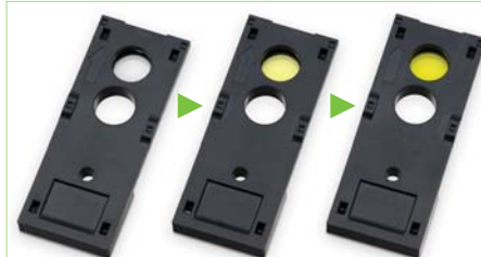
Colorimetric reaction to exposure

Sensor element employs the chemical reaction between formaldehyde and \beta -diketone on a porous glass. The concentration of rutidine derivatives yellows the sensor in proportion to the formaldehyde concentration and the duration of exposure. The difference of absorbance between samples is measured by radiating a constant wavelength light (absorptiometric method) and then an algorithm converts to ppb or \mu\text{g}/\text{m}^3 HCHO.